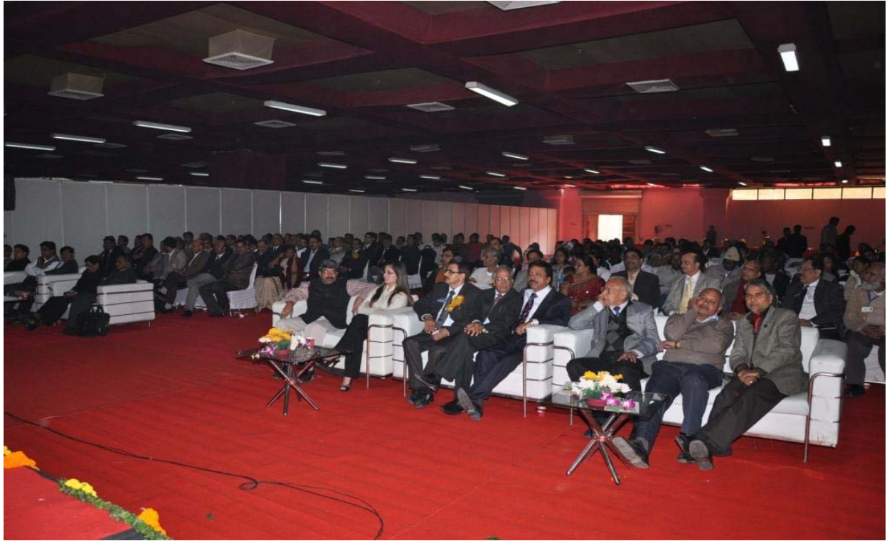
Entrepreneurs, IIA members, Visitors & exhibitors attending the Seminar