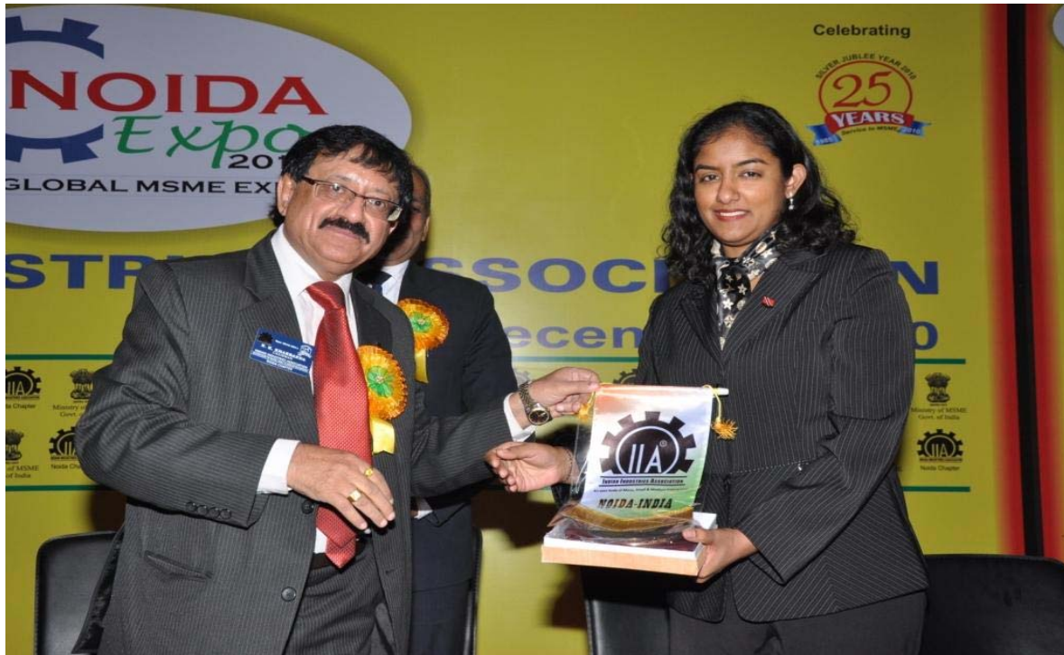
Presentation of IIA Noida Flag to Acting High Commissioner , Trinidad & Tobago ,New Delhi