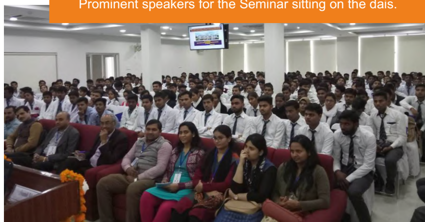
Audience gathered for the Seminar on 23rd Feb. 2019