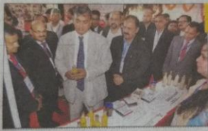
इंडिया फूड एक्सपो का शुभारंभ