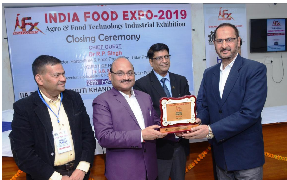
1st Prize winner of IFX-2019- Pritul Machines

In the closing ceremony of India Food Expo 2019, the 1st prize for the best stall was given to Pritul Machine, Muzaffarnagar, the 2nd prize is bagged by the Big Hotel Store, Lucknow and the 3rd Prize is given to a Micro Unit promoted by a women entrepreneur “Sweet Nothing”. Consolation prize for the best stall was given to Royal Honey & Bee Farming Society Lucknow.