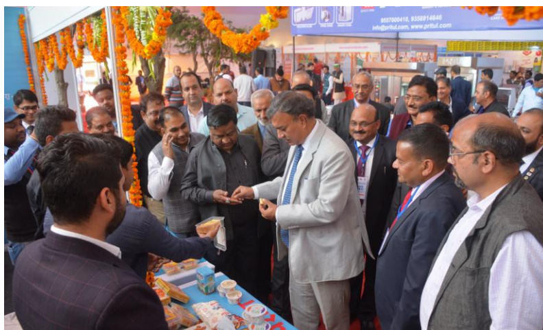
Chief Guest along with all dignitaries visiting stalls at IFX-19

Along with all dignitaries Chief Guest visited the stalls displaying Food Processing Machinery, Agro & Food Processing Technologies, Agri & Food Processing Products developed by Research Institutions, Food Product testing facilities, Innovative Food Products, Consumer Food Products & Food Processing Industries Policies & Schemes.